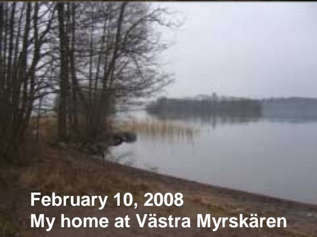
February 10, 2008 My home at Västra Myrskären